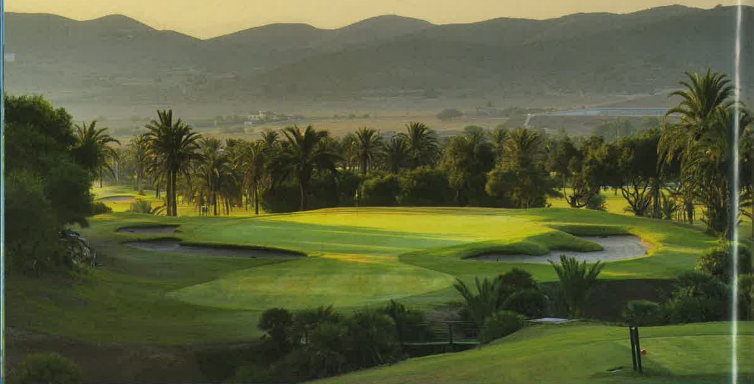
La Manga (North)