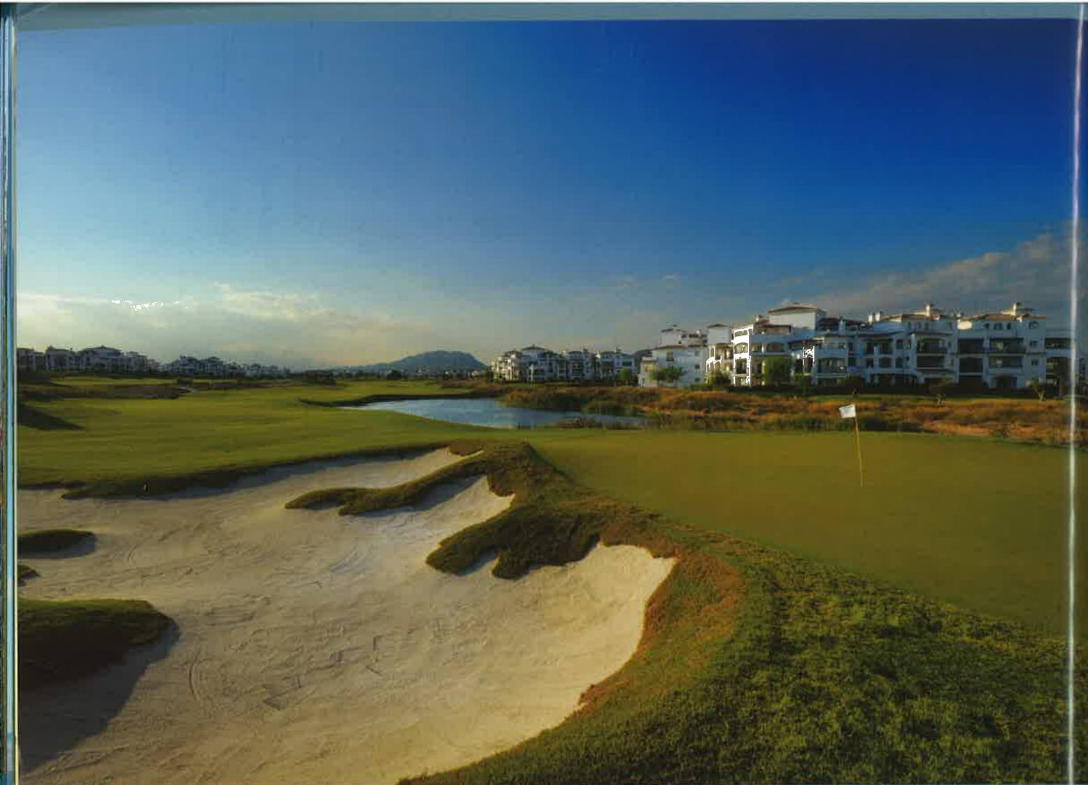
Hacienda Riquelme Best Golf