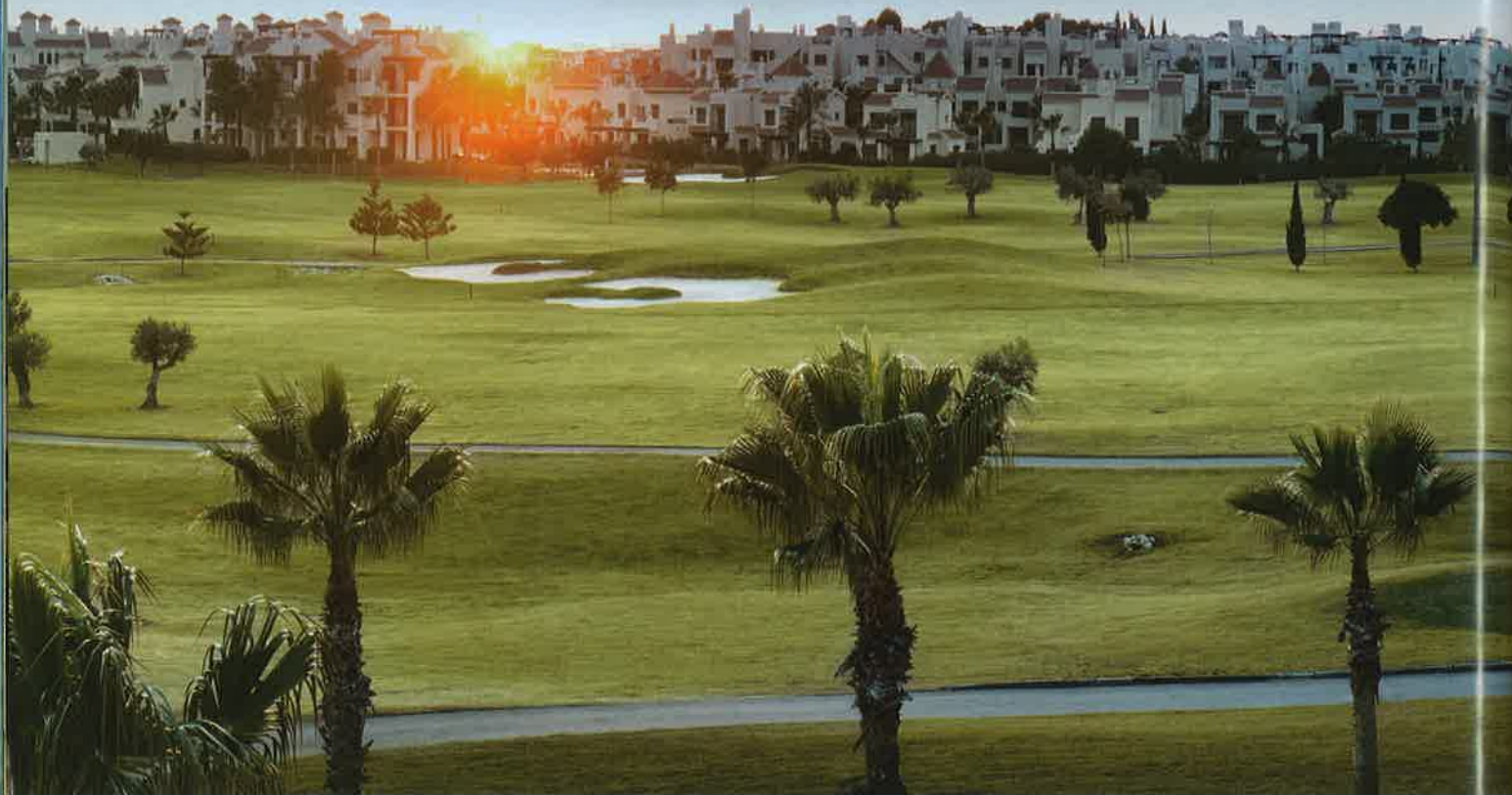
Roda Golf Course